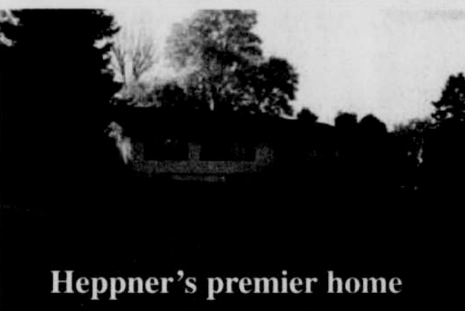
Heppner's premier home

Large home with daylight basement and large deck overlooking the golf course. 3 fireplaces, large country kitchen on main floor and mini kitchenette in basement. Attached carport with extra storage shed. 11.4 acres $248,000