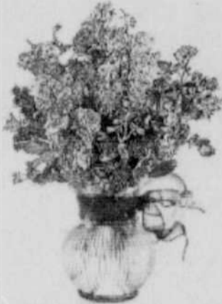
Teleflora's Lavender Pitcher Bouquet

This hand-blown lavender glass pitcher has a certain subtle charm. Add a bunch of delicate flowers and it becomes a magnificent gift for Mom's special day.