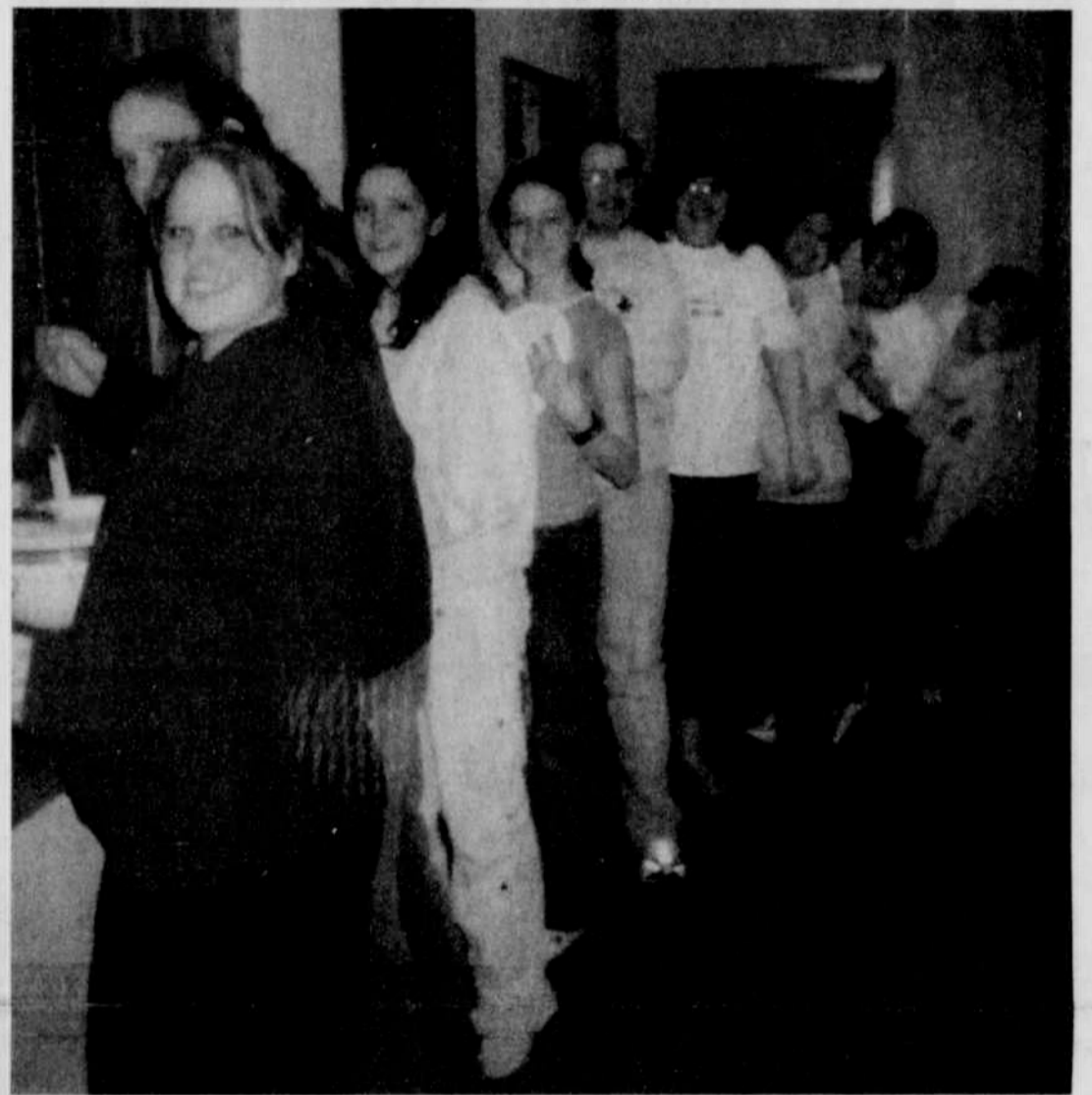
Teens at IUCC break their fast after going 30 hours without food.

Eleven Ione United Church of Christ middle and high school students joined a half million American teens in getting "Fed Up" enough to do the World Vision 30-Hour Famine February 28-29.