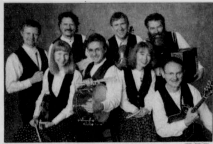
Trail Band

The Trail Band will perform an encore concert at this year's "Wee Bit O' Ireland." Brought to the celebration a second time by the Morrow County Unified Recreation District, six members of the group, with two guest musicians, will delight all ages with their humor and musical talents. The district's sponsorship of the event provides an uncommon opportunity to concert-goers: The Trail Band's new, unique concert of Irish songs and stories will be free.