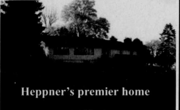
Heppner's premier home

Large home with daylight basement and large deck overlooking the golf course. 3 fireplaces, large country kitchen on main floor and mini kitchenette in basement. Attached carport with extra storage sheds. 11.4 acres $248,000