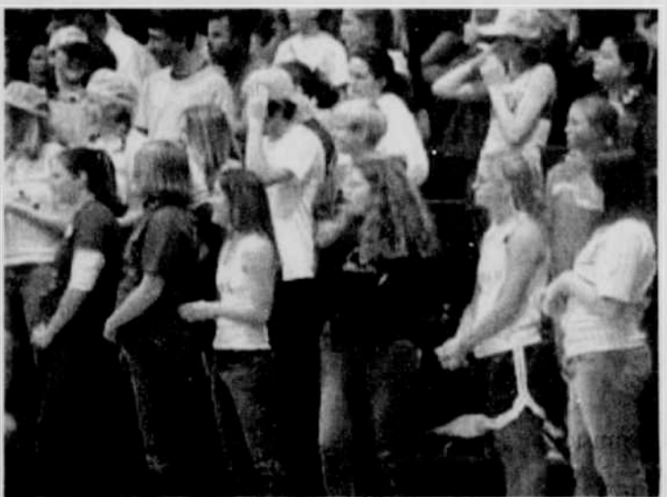
Heppner fans cheer on the team