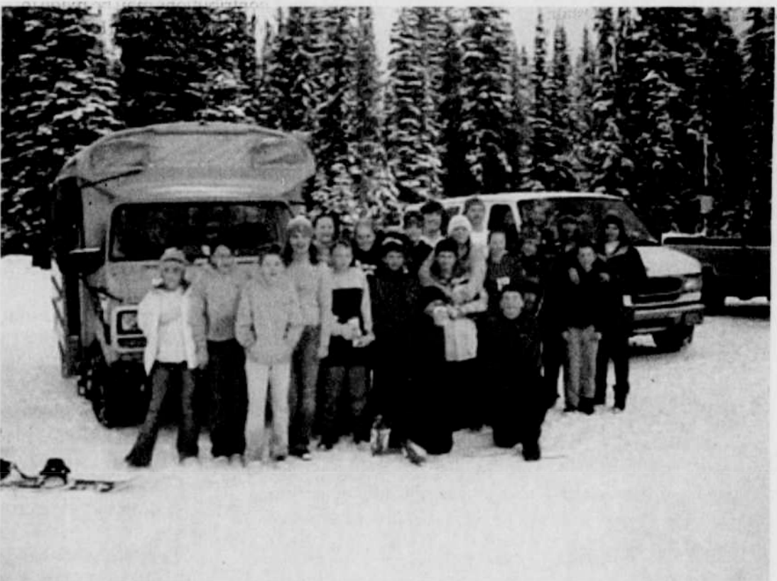
HHS Outdoor Club prepares for fun day of skiing and snowboarding at Anthony Lakes Ski Resort.

The Heppner High School Outdoor Club held their first ski trip on Sunday, Dec. 7.