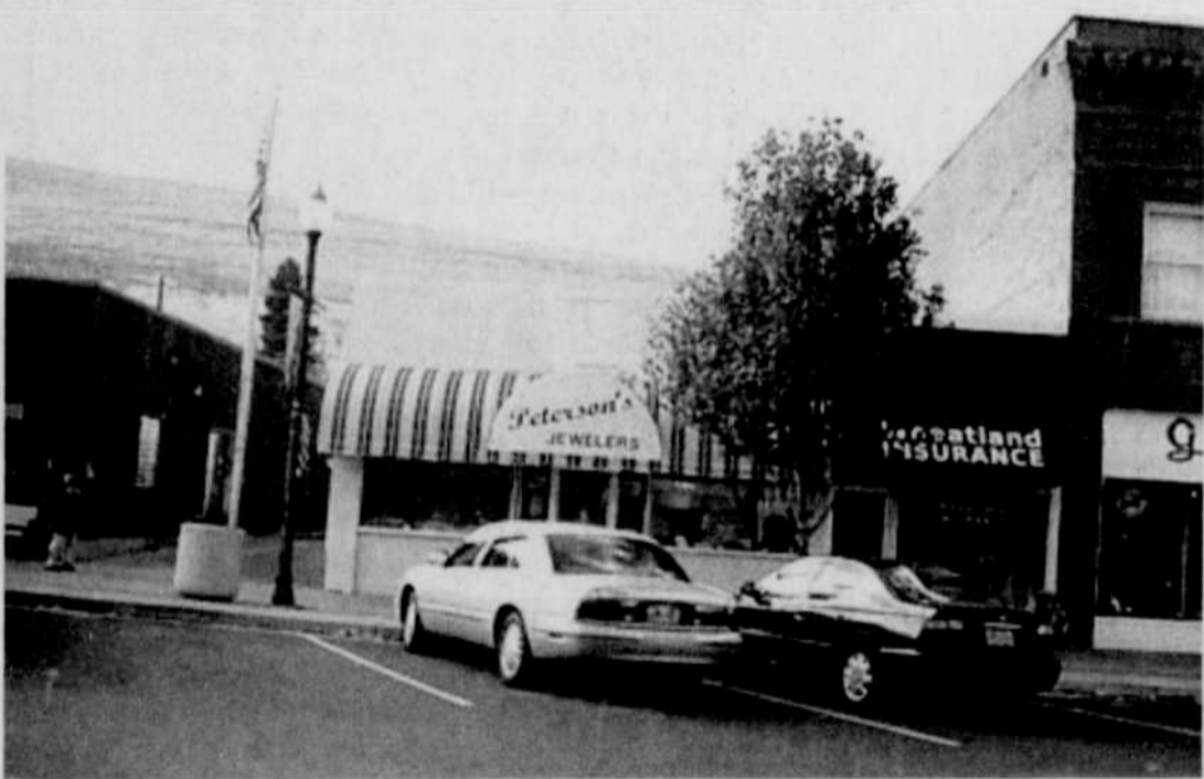
Peterson's has a color change and Wheatland Insurance sports its new name on their awnings.

Three new awnings have gone up on Main Street in Heppner. The awnings were installed by F.O. Berg out of Spokane, WA. The three businesses receiving new