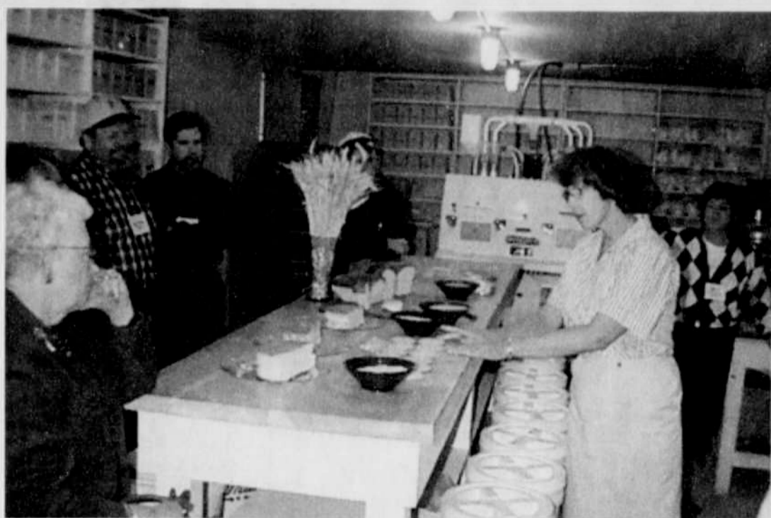
Urban legislators tour the wheat marketing center in Gilliam county last week