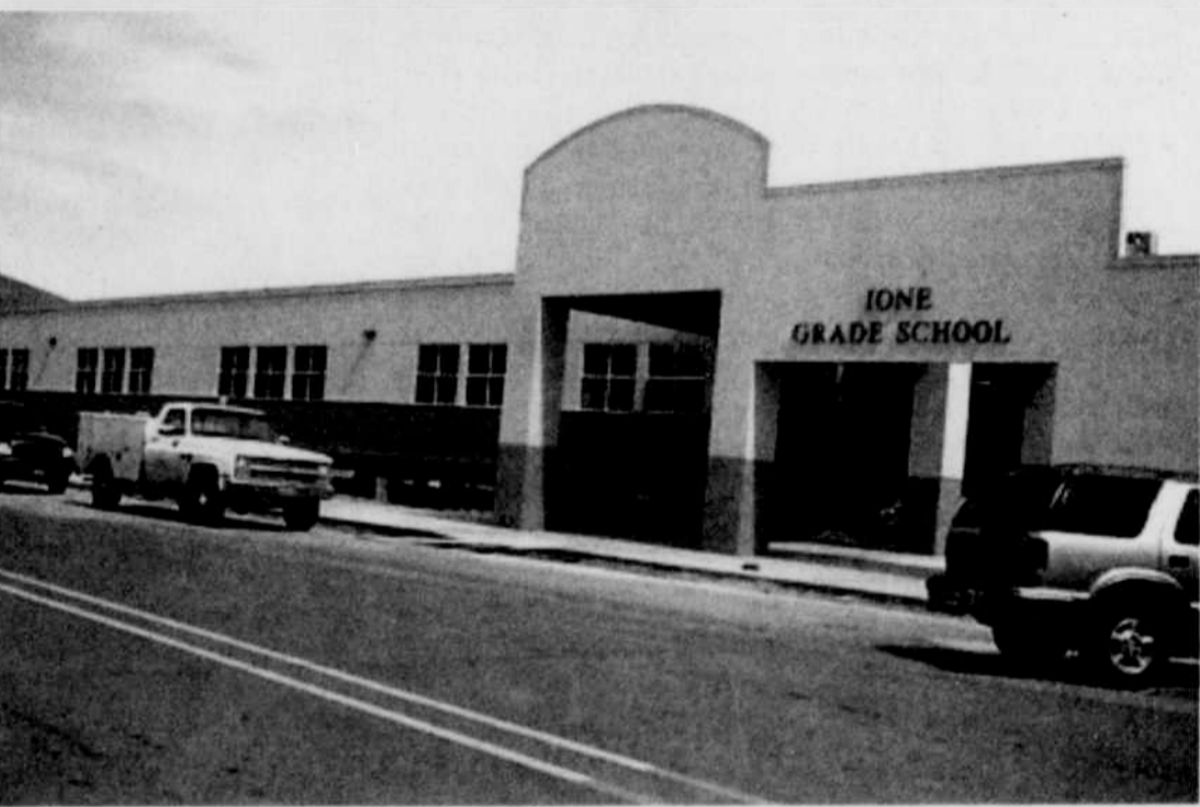
New Ione Elementary School building

Two newly built buildings await students in both Ione and Heppner. The two new buildings are open and will be ready for students return on Sept. 2.