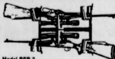
Model BSR-2 (overhead-horizontal mount)

ALL NEWS AND ADVERTISEMENT DEADLINE: Friday 5:00 P.M. This week