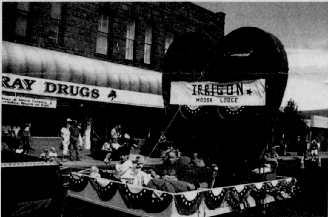
1 st Place Community Float- Irrigon Moose Lodge.