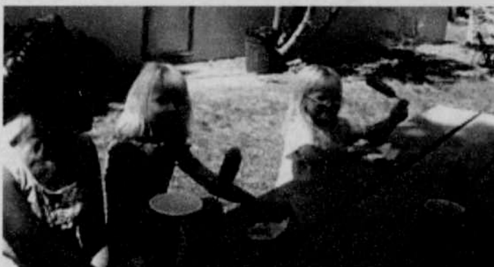
Everyone enjoys the foods offered at the Fair.

There are a variety of foods at the fair this year.