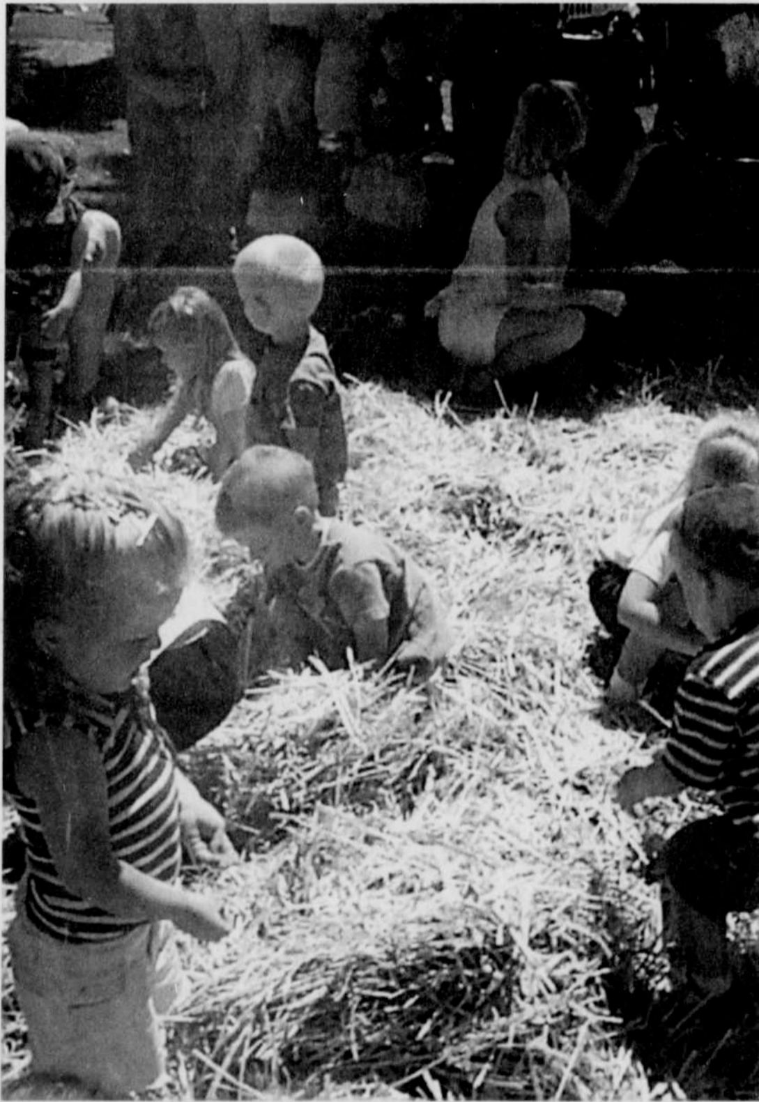
Cashin' in Kids look for money during the coin scramble Friday at the annual Ione Fourth of July Celebration. More pictures page 3.

VOL. 122 NO. 28 8 Pages Wednesday, July 9, 2003 Morrow County, Heppner, Oregon