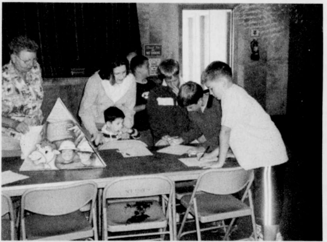
Children gather to register for St. Patrick's/St. William's religious vacation school.

Religious Vacation School began Monday, June 23 for St. Patrick's and St.