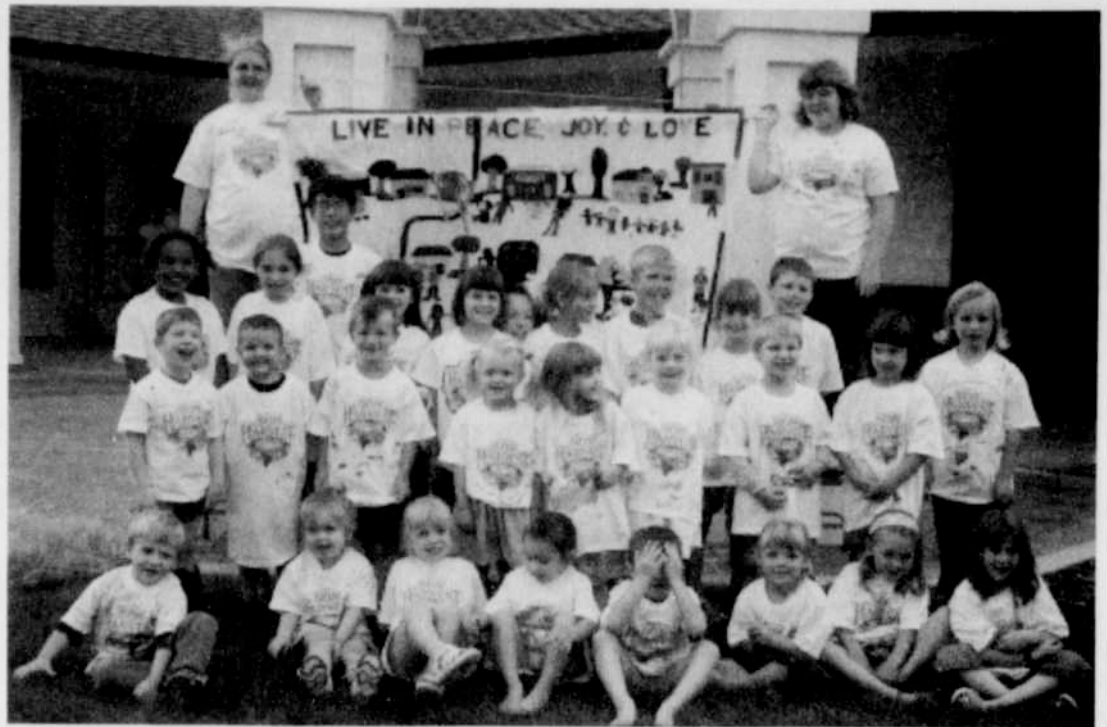
Approximately 30 children participated in Ione's United Church of Christ's VBS School, June 16-20. The theme for the week was Son Country Harvest and the children learned about growing the "fruits of the Spirit."