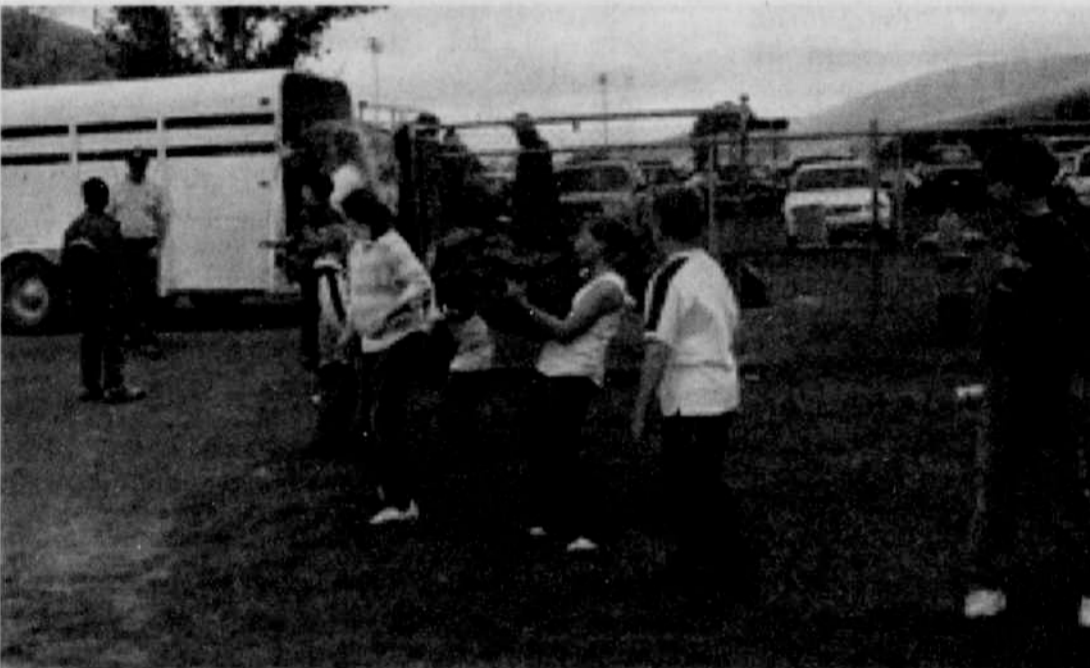
Fifth graders perform annual ritual of unloading the sixth graders gear after their return from Tupper Outdoor School.