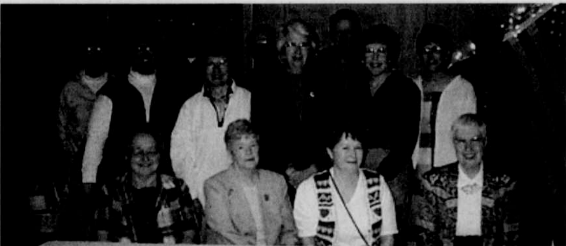
Last week was National Volunteer week. To honor local volunteers the Heppner Chamber of Commerce invited many of them to lunch last Tuesday.