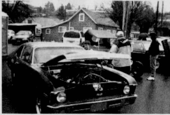
Just one of the many vehicles at the Cruz-In

Fifty-one vehicles from the Columbia Basin and Blue Mountain area participated in the 2003 St. Patrick's Celebration Cruz-In, March 15 in Heppner.