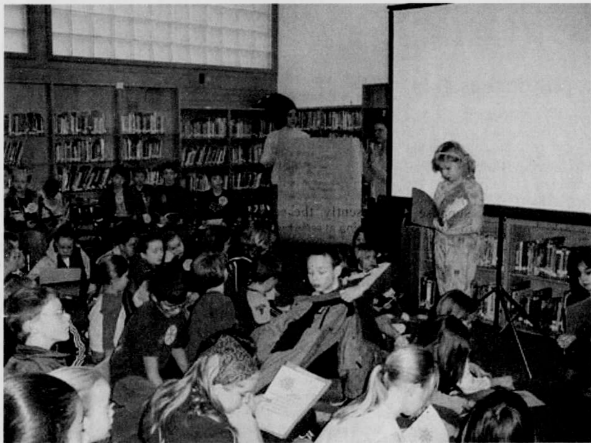
Students attend writing workshop