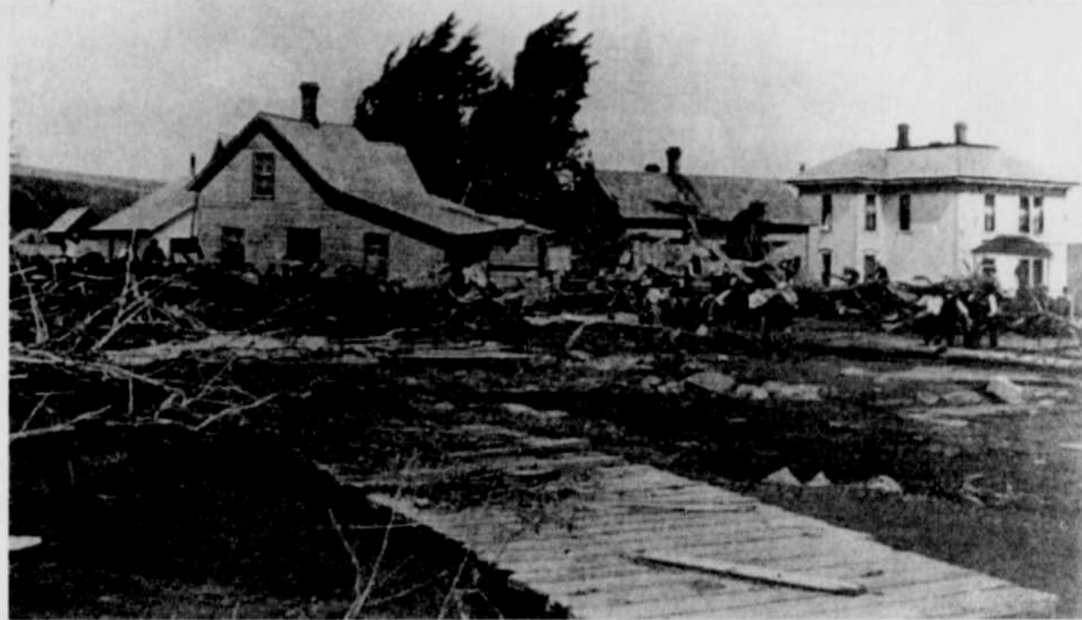
In the right-hand background, the Penland House withstood the power of the 1903 flood.