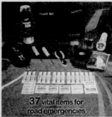
37 vital items for road emergencies