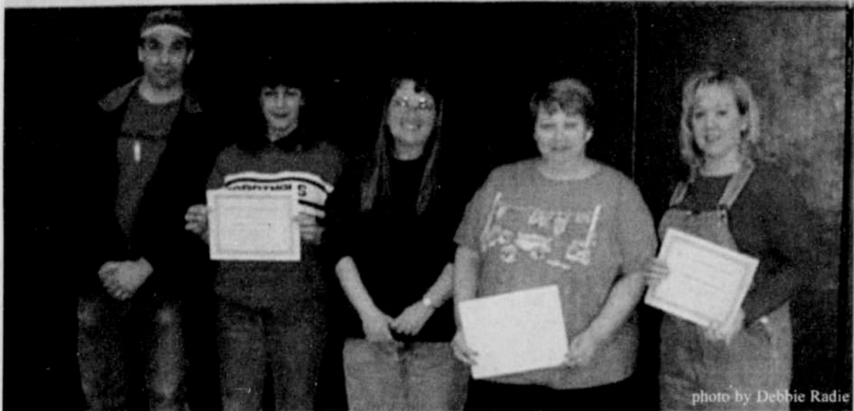
Representatives of Dobyn's Pest Control, The Office Café and Sunflower Junction were among those honored by the Cardinal Booster Club

Friday, Jan. 24, the Lone Cardinal Booster Club recognized the following businesses for their support this past year: Red Lion Hotels, Bi-Mart, Oxford Inn & Suites, Simplot, The Office Cafe, Dobyn's Pest Control and