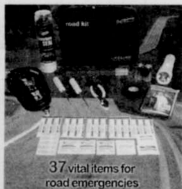
37 vital items for road emergencies

STANDARD ALIGNMENT THRUST ALIGNMENT 4 WHEEL ALIGNMENT (Shims included) 22 95 44 95 69 95