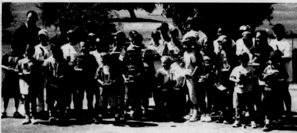
Over 40 children, aged six to 14, completed golf lessons this year.