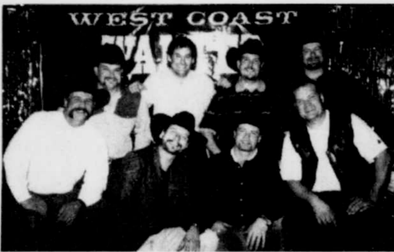
West Coast Wanted

Those who kick up their heels at the Fourth-Annual Morrow County Fair and Oregon Trail Pro Rodeo Kick-Off Dance will have the chance to dance to music from "West Coast Wanted", a country/western band from the valley.