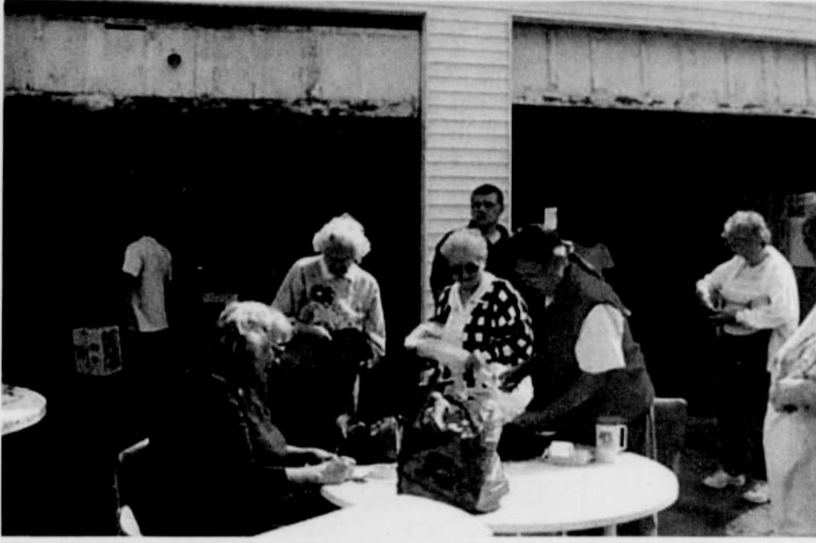
Volunteers help customers at the Lexington Fire Fund Sale.