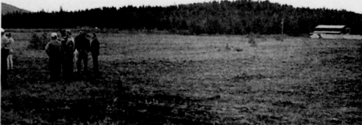
Visitors look over proposed ATV park site at the Kinzua Re-load site.

A planned All Terrain Vehicle (ATV) campground and trail system in Morrow County is moving closer to becoming a reality after a visit by state officials to the area this past weekend.