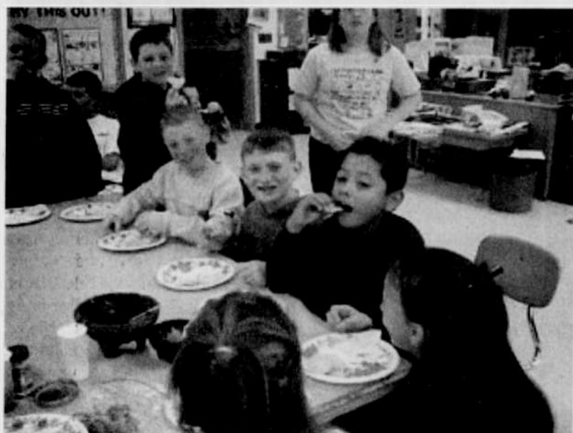
Fourth grade students enjoy a little Mexican cuisine.