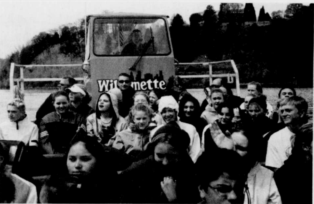
The students take a ride on the Willamette in a jet boat.