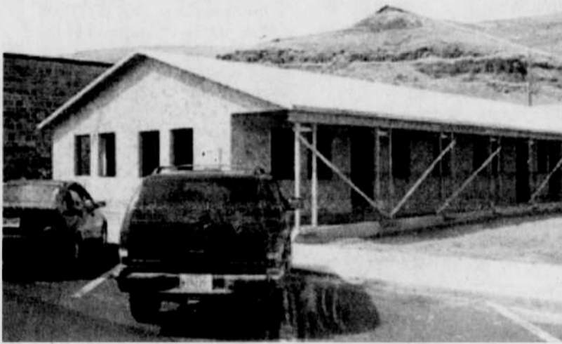
The new Wheatland building under construction on Ione's Main Street.