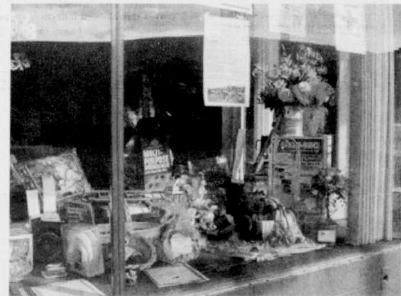
St. Patrick's Celebration auction items on display in the Heppner TV window