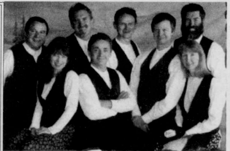
The Trail Band