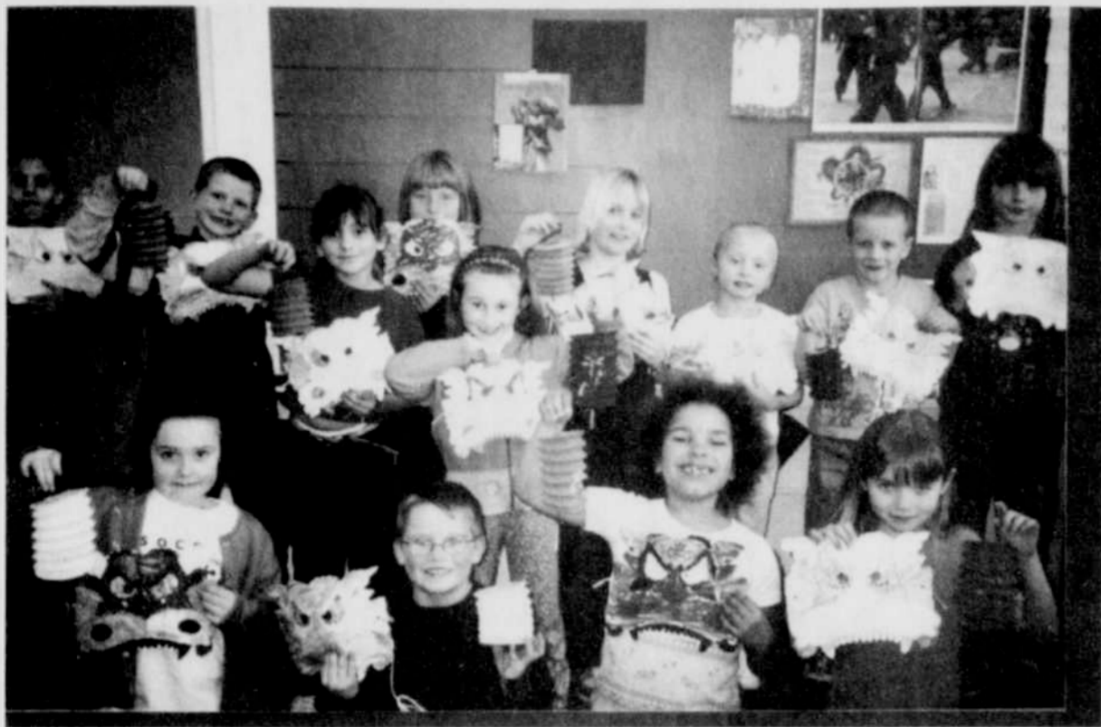
Ione Elementary first/second grade class celebrates Chinese New Year with dragon masks and lanterns.