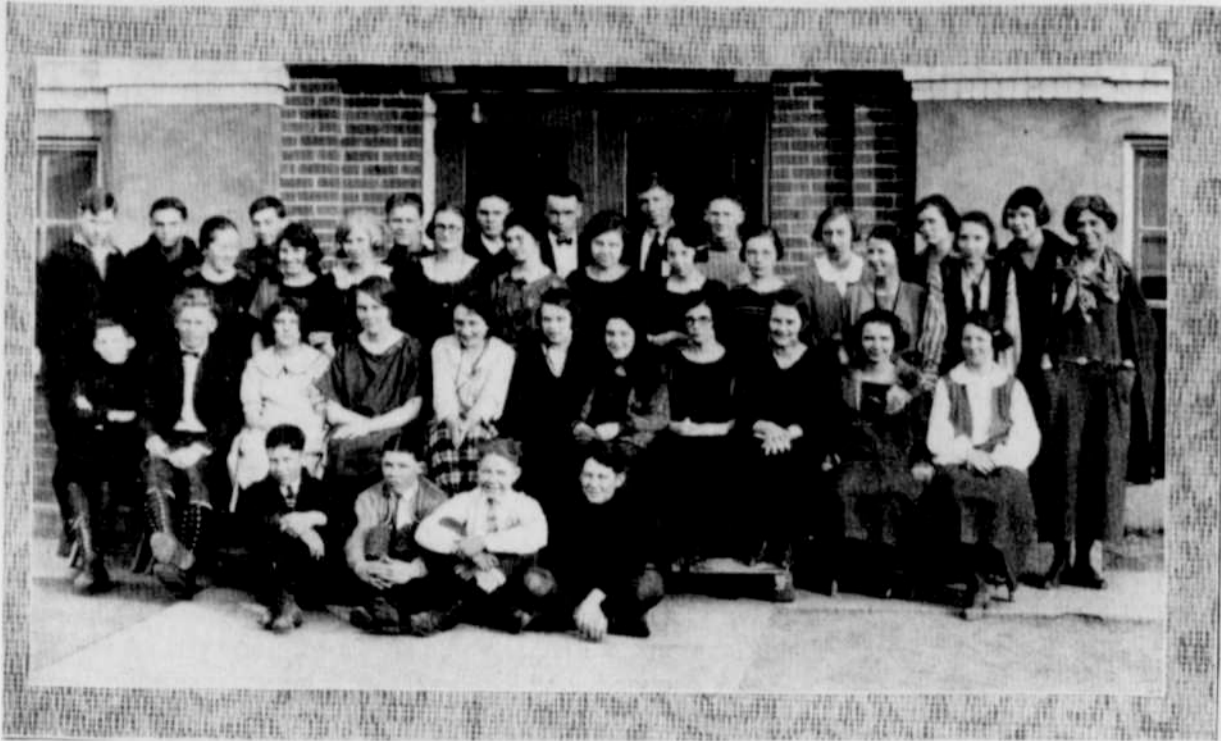
Photo of class of 1924 identified

The monthly card party at the IOOF Hall will be held Saturday, March 2, at 7:30 p.m. Cost is $3. This month's proceeds will be donated to the IOOF Friendship Fund, which is used to provide emergency assistance such as rent, medications, etc., for members of the order. The card party is open to the public and everyone is invited for an evening of fun and refreshments.