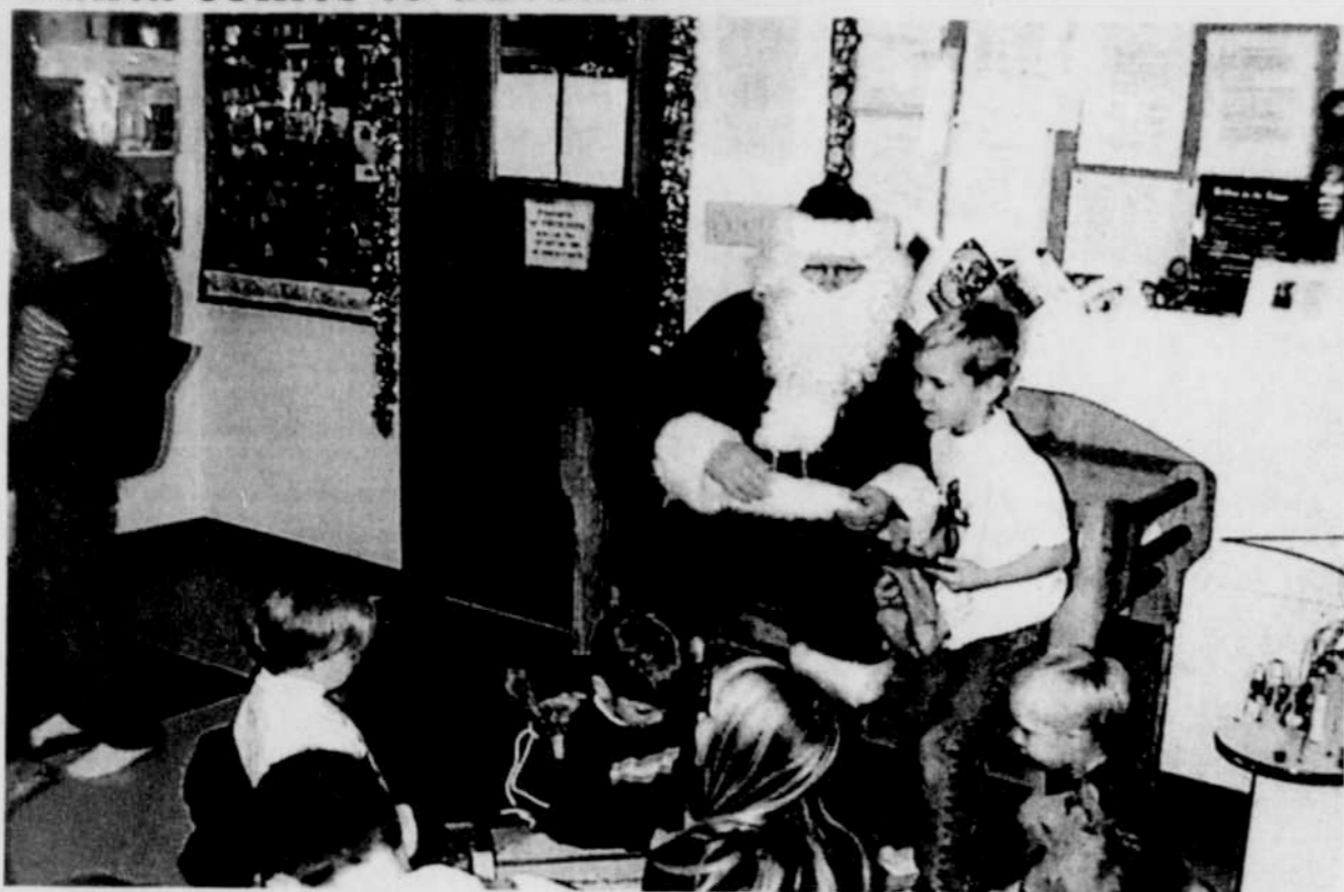
Santa came to Heppner Day Care Friday to the delight of day care students and staff.