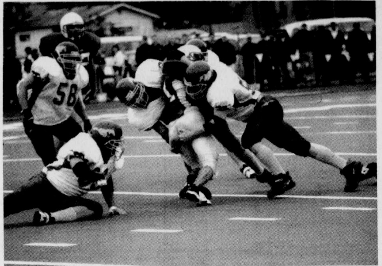
Mustang tacklers bring down an Amity running back

Campuzano led the Warriors with 204 yards on 23 carries and three touchdowns, with Groom adding