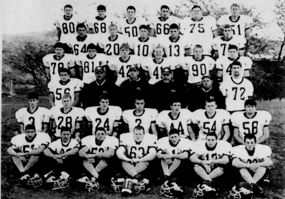
Heppner High School Mustang football team