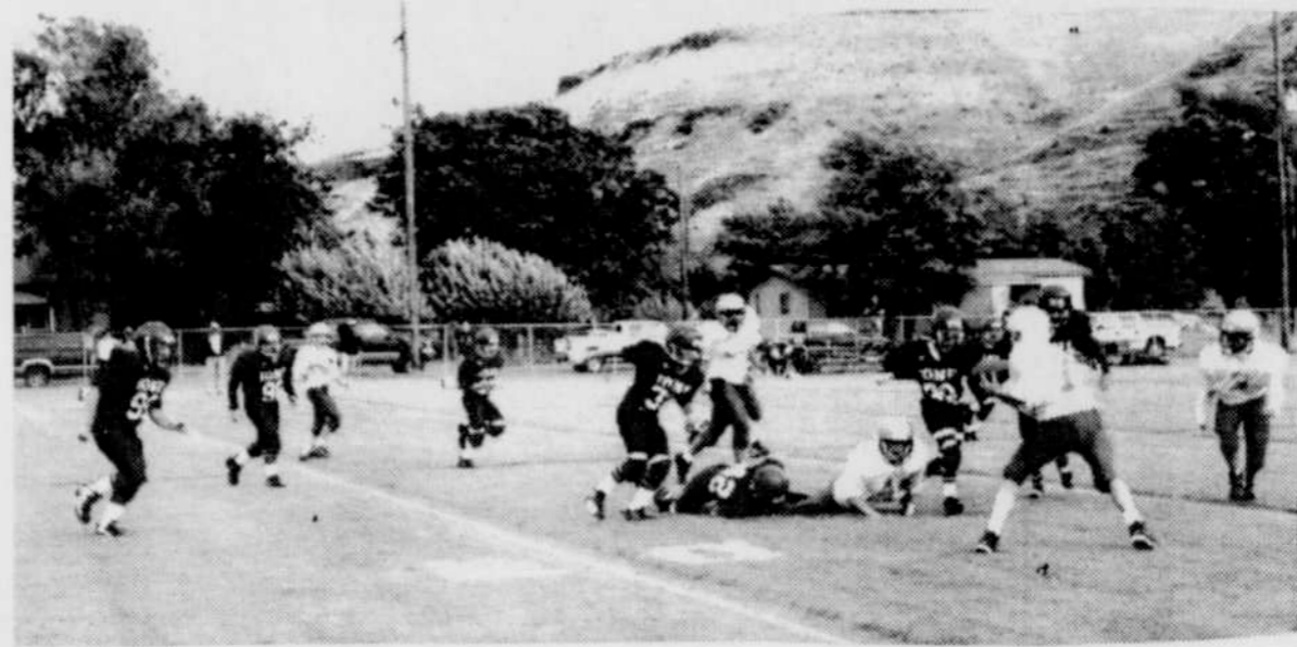
The Ione Junior High football team beat the Echo Junior High School team, 41-12, on Friday, October 12, at Ione.