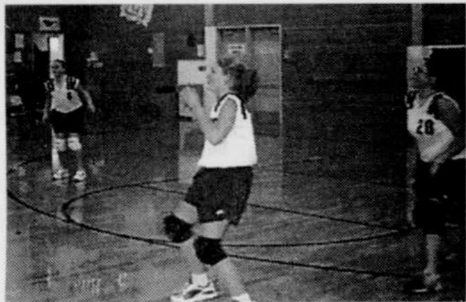
Heppner Ponies volleyball team