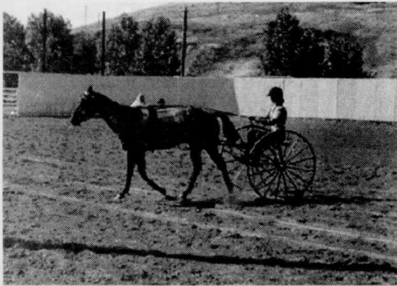
Sibbea Jones at the Morrow County Horse Show driving contest