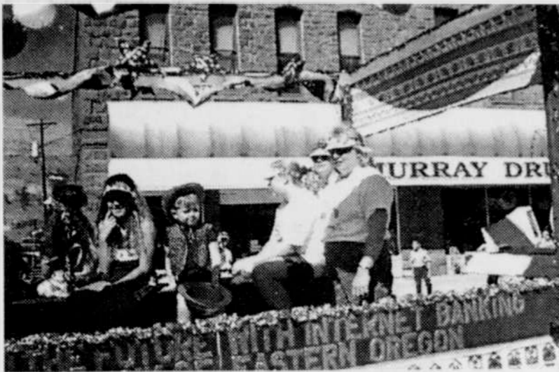
Bank of Eastern Oregon float

Sweepstakes winner: Heppner United Methodist Church.