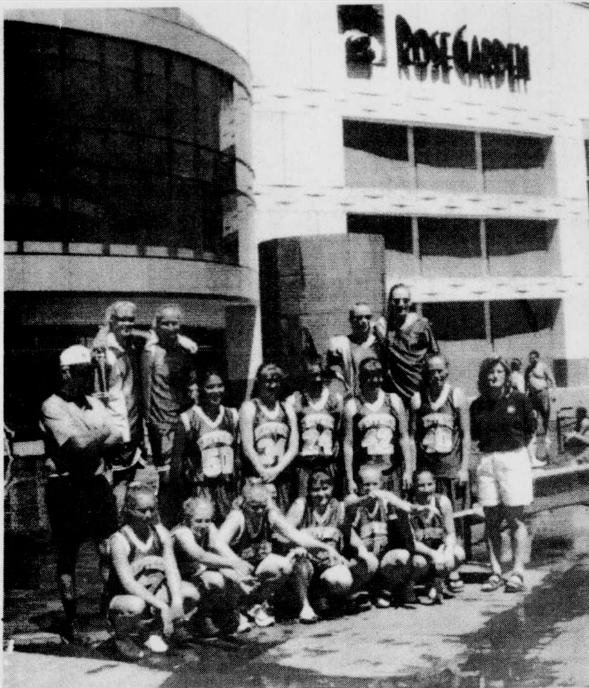
Lady Mustangs and their coaches at the Rose Garden