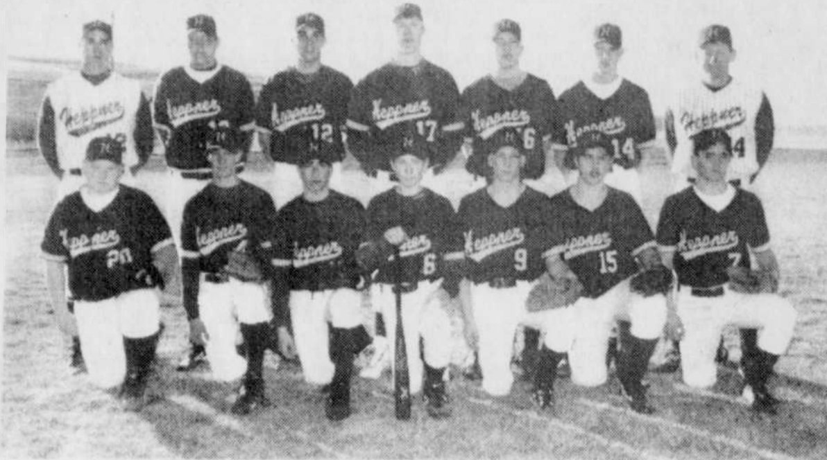
The HHS JV team