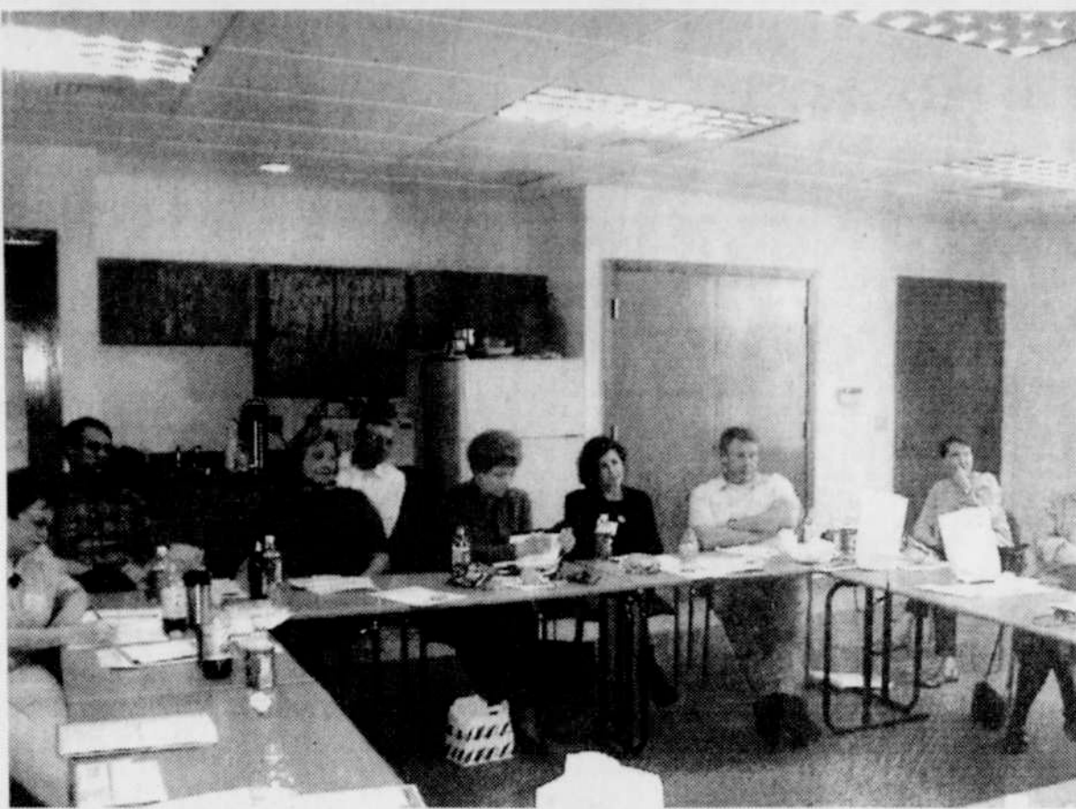
Participants in the Community Oregon visitation discuss issues facing rural Oregon following two days in Heppner and Ione.

The first ever Community Oregon visit was well attended last week, as 14 people from around the state came to Ione and Heppner for a two-day visit.