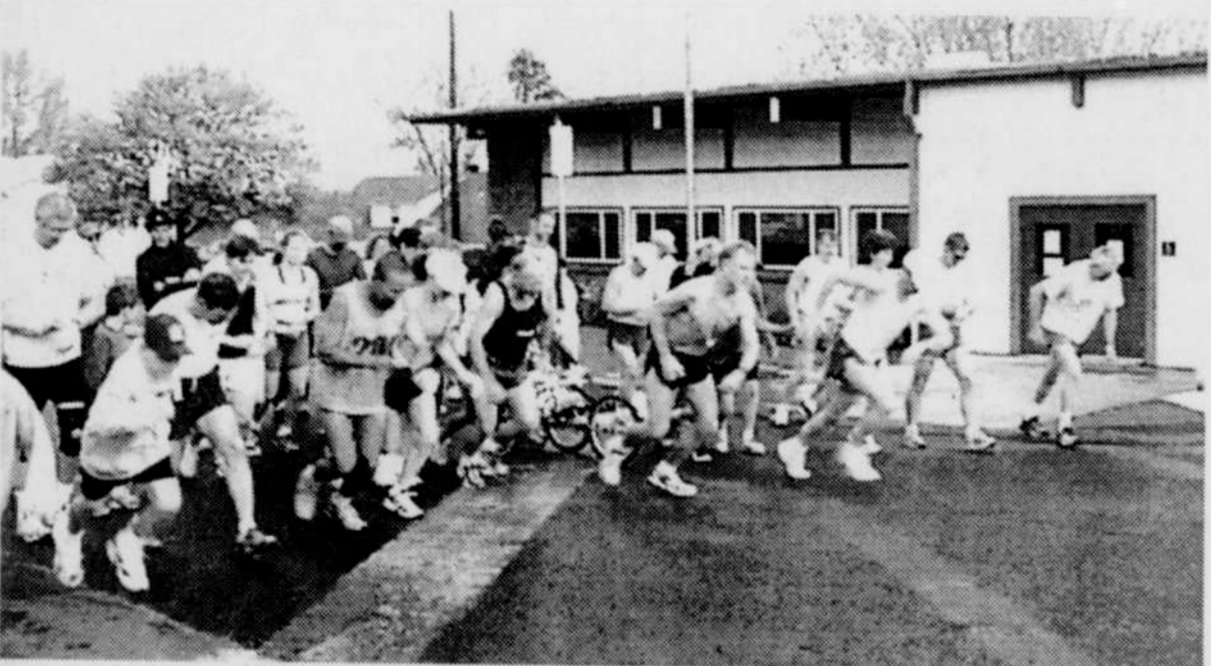
And they're off!