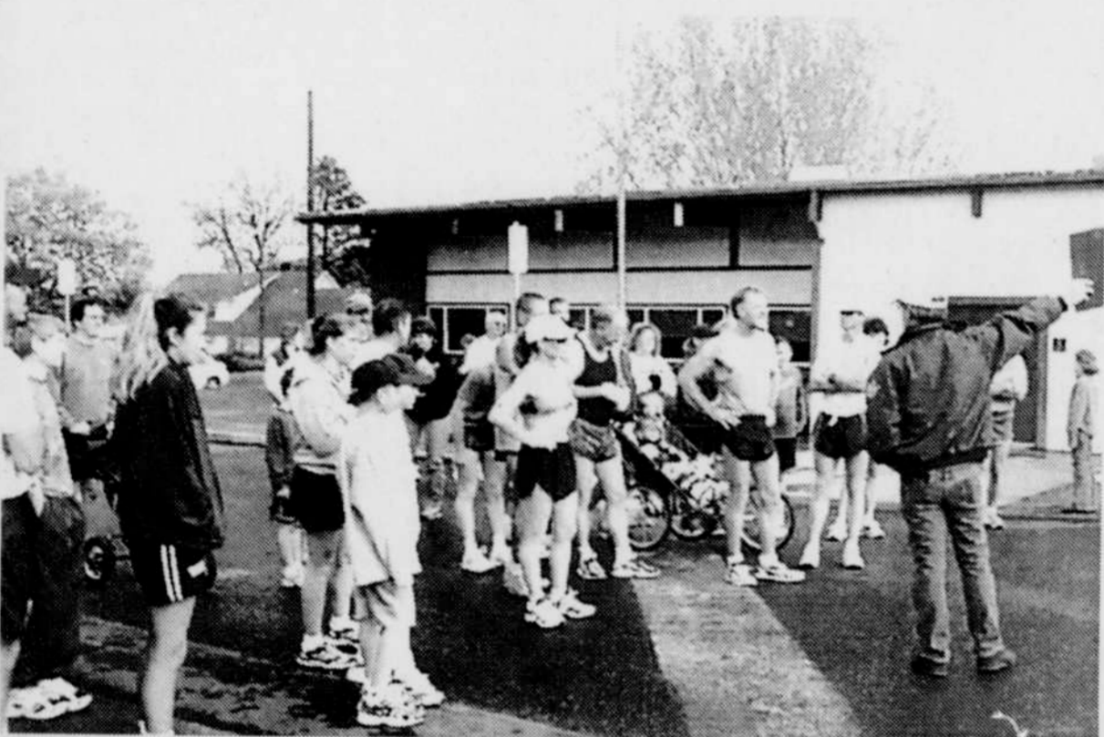
Rolling Hills Run contestants hear last minute instructions before the starting pistol on Saturday, April 28, in Heppner.