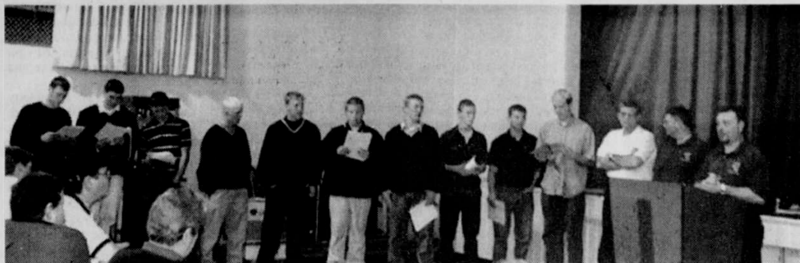
The Ione boys basketball team received second place in district and advanced to the state 1A playoffs in Baker. They also placed within the top 10 schools academically, receiving a Dairy Farmers academic award.