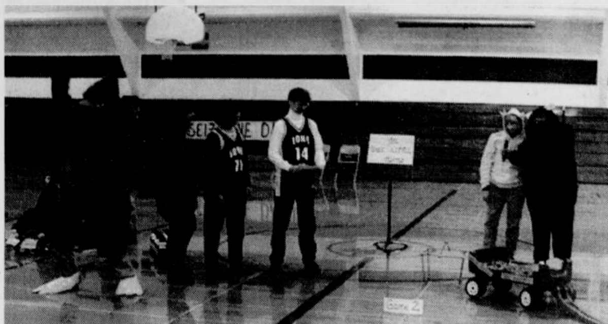
At the Ione Cardinal Boys Basketball Pep Assembly the mothers of the team performed for the audience with a skit about the Cardinal strength using a modified version of the story of the three little pigs.