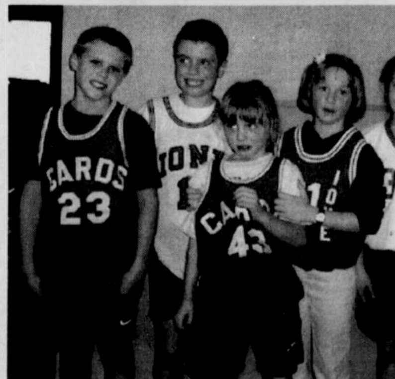
The Ione PeeWee basketball team