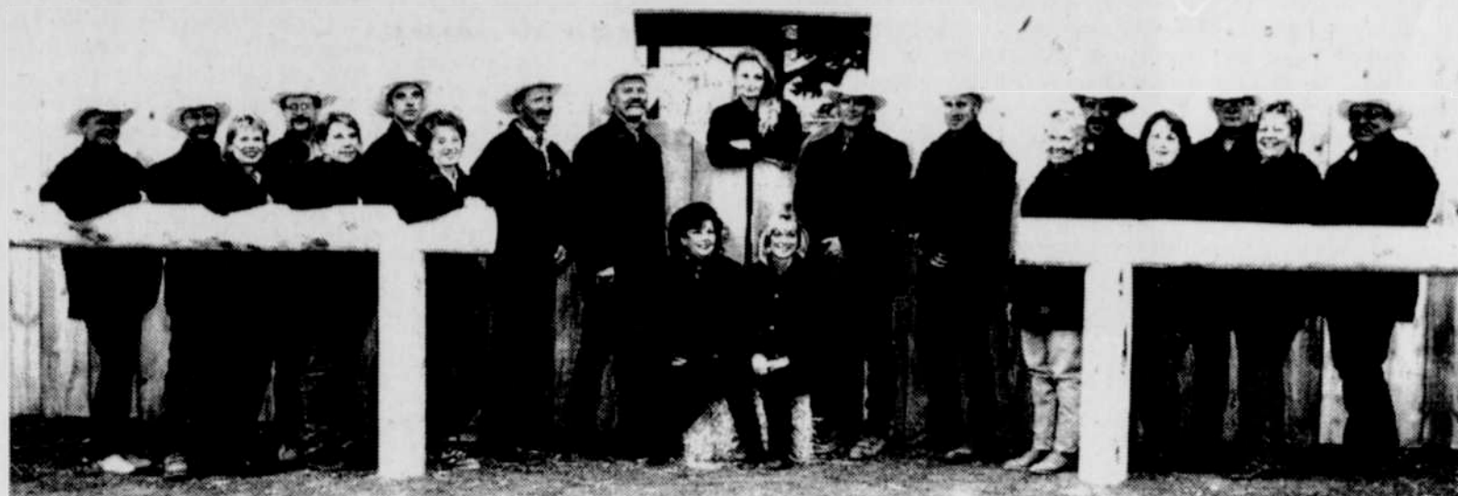
The 2001 Oregon Trail Pro Rodeo committee