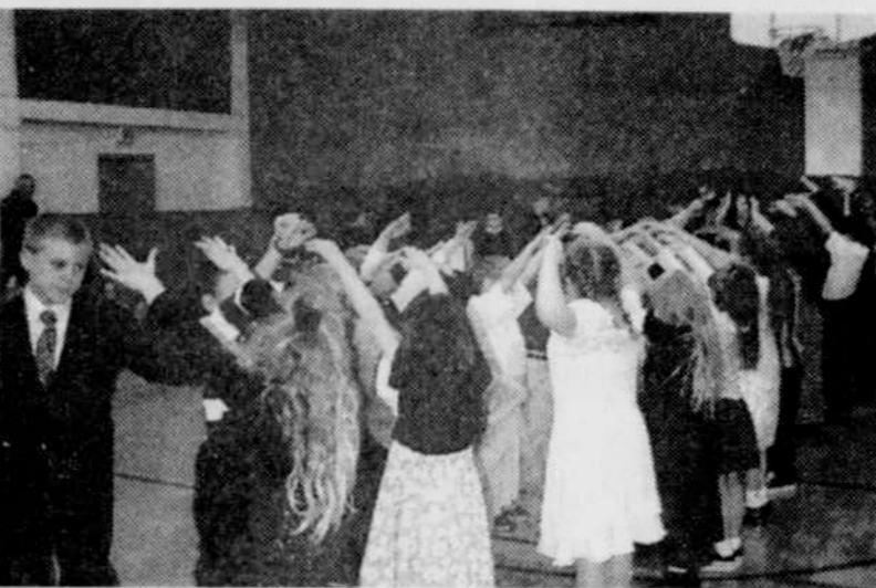
Ione Elementary School students perform the Grand March during the IES Inauguration ceremony Monday.