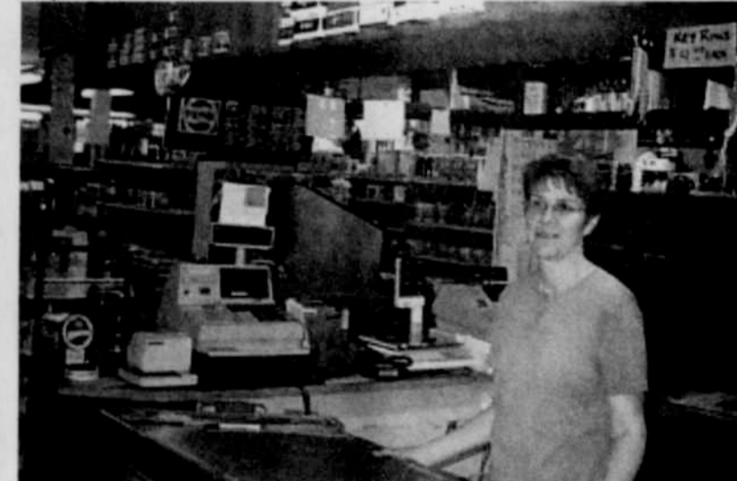
Long time grocery store, Court Street Market, closed its doors the end of October because of poor economic conditions. The store had been in continuous operations since 1946