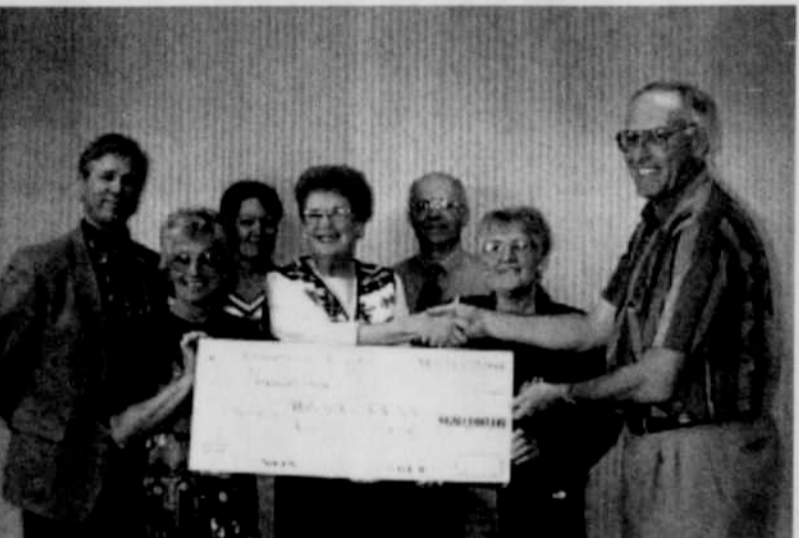
Willow Creek Valley Assisted Living receives USDA loans to build a new facility in Heppner.