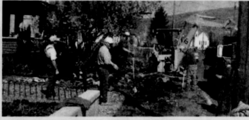
Volunteers with the Neighborhood Enhancement Team work to improve the community