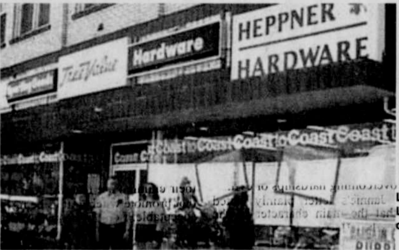
Coast to Coast becomes Heppner Hardware