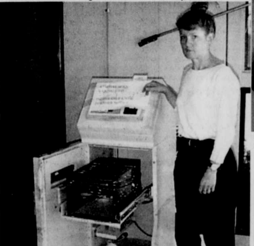
The lone Bank of Eastern Oregon ATM was damaged and robbed Aug. 8