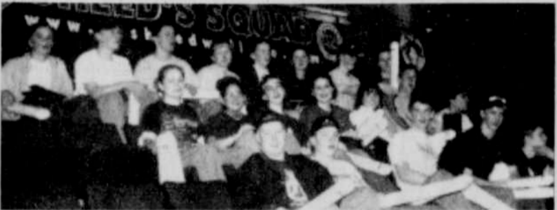
The lone Youth Group is honored for charity work by the Portland Trail Blazers