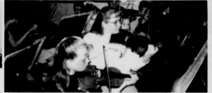
Willow Creek Symphony presents concerts for community.