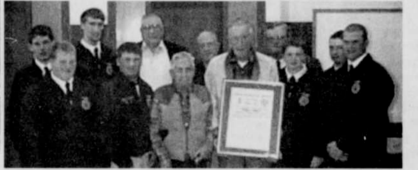
Heppner FFA club holds final meeting. Due to budget shortfalls, the entire ag program was discontinued for Morrow County Schools.