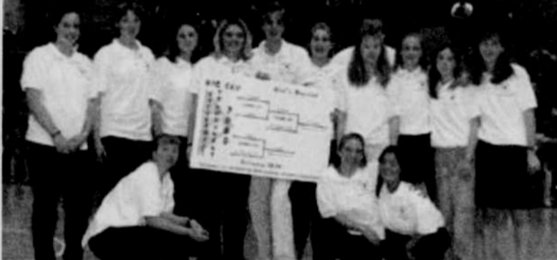
Lady Cardinals, number one at district, earn second at state. The Lady Cards lost a one-point heartbreaker to Condon in the State 1A championship basketball game.