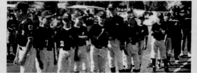
Heppner hosted the first Little League tournament in 30 years July 14-23.