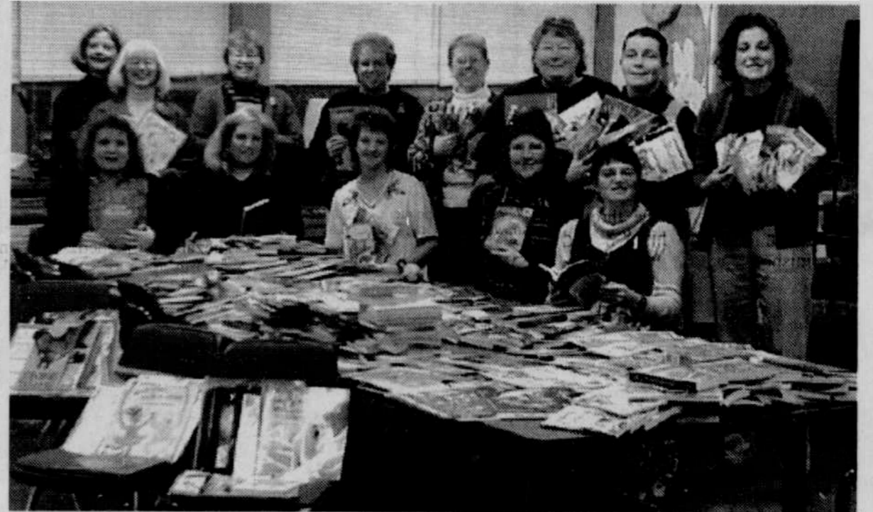
Heppner Elementary School teachers show the new books they purchased from proceeds from the Parent Teacher Club book fair.

The Heppner Elementary Parent-Teacher Club recently held a book fair at the school. The club asked the teachers to decide how to spend book fair proceeds. The teachers opted to visit the Portland Scholastic Book Warehouse to select books personally.