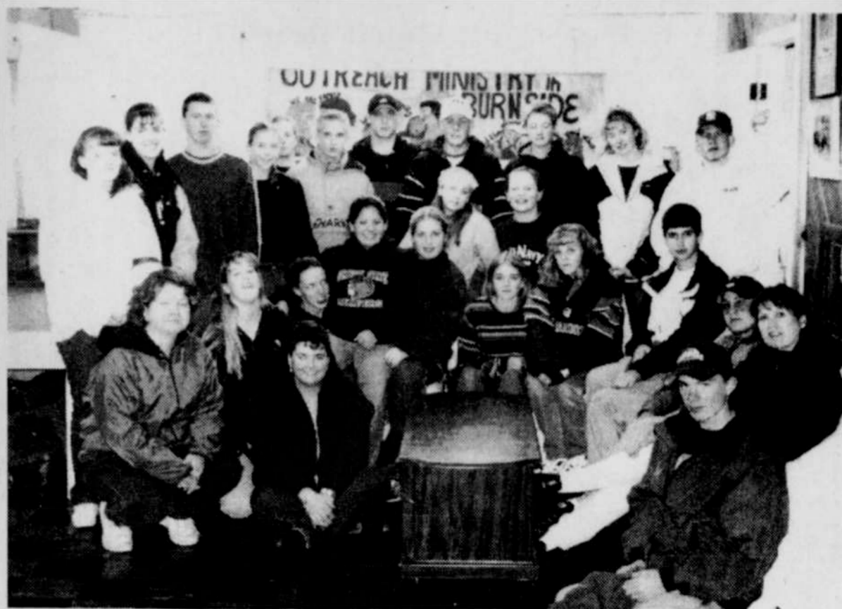
Ione Youth Group at Outreach Ministry

274 North Main Street, Heppner • 676-5440