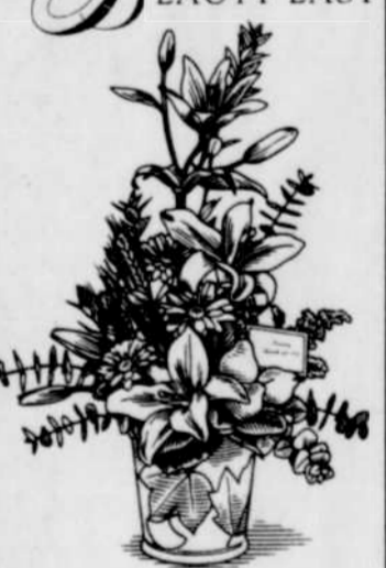
Give Teleflora's Country Harvest Bouquet

A lovely fall bouquet. A hand-painted terra-cotta cachepot richly embossed with the season's most glorious leaves. It's like owning the miracle of autumn all year long. To send this charming gift anywhere in the U.S. or Canada, call or visit our shop.